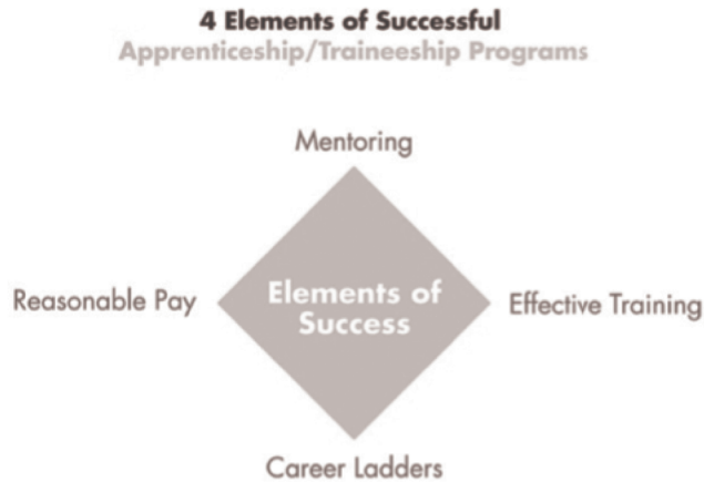
Figure 2: Four Elements of Successful Apprenticeship